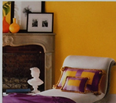
Transitional Color 1